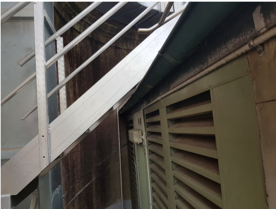
Figure 50: Bowing Gutter Above North West Flat Roof