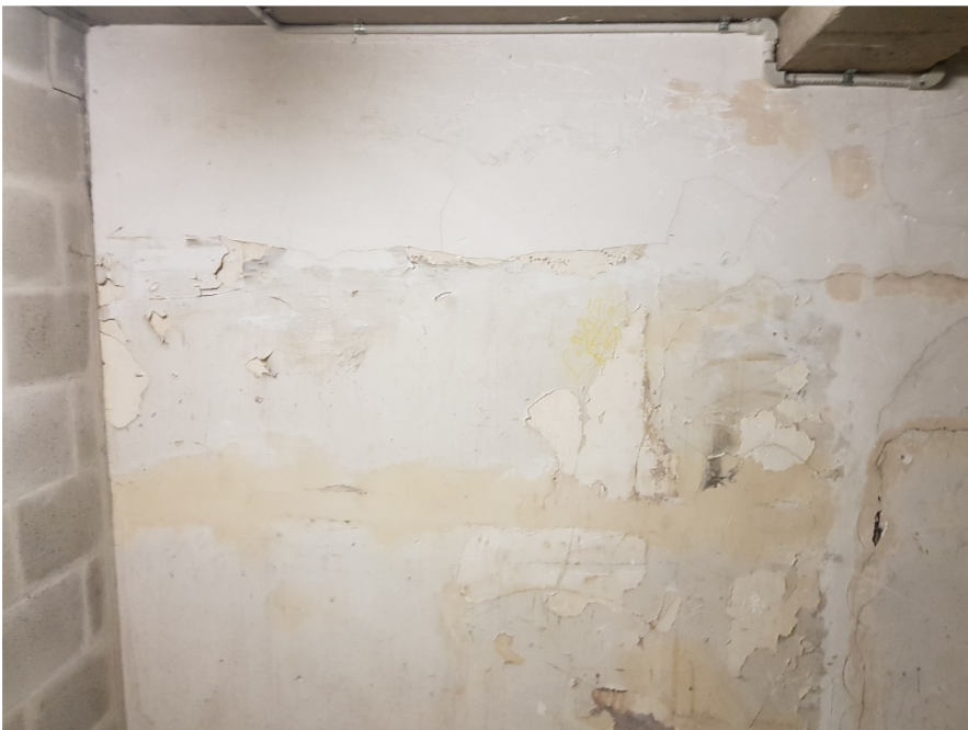
Figure 34: Damp Fire Escape Walls Under North West Flat Roof