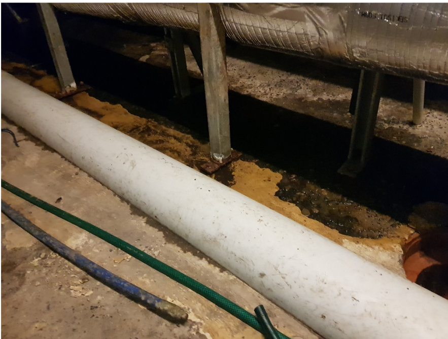
Figure 44: Ponding Water in Lower Ground Service Corridor