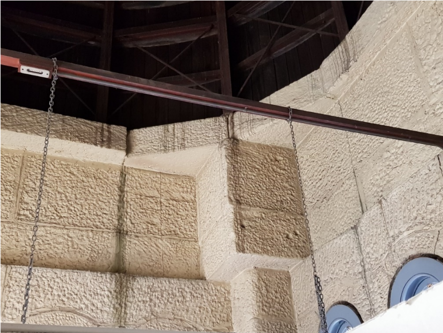
Figure 37: Water Staining From Dome Roof