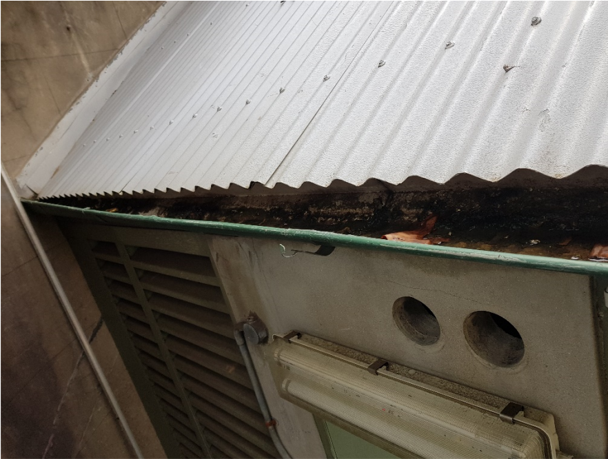
Figure 51: Broken Fixing on Gutter Above North West Flat Roof