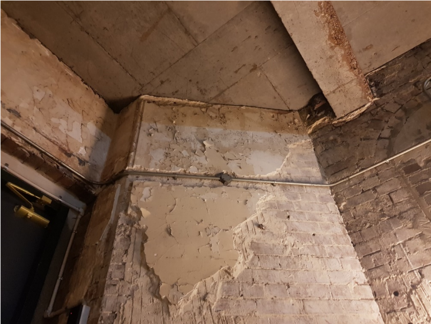
Figure 41: South Fire Escape Damp and Spalling Concrete