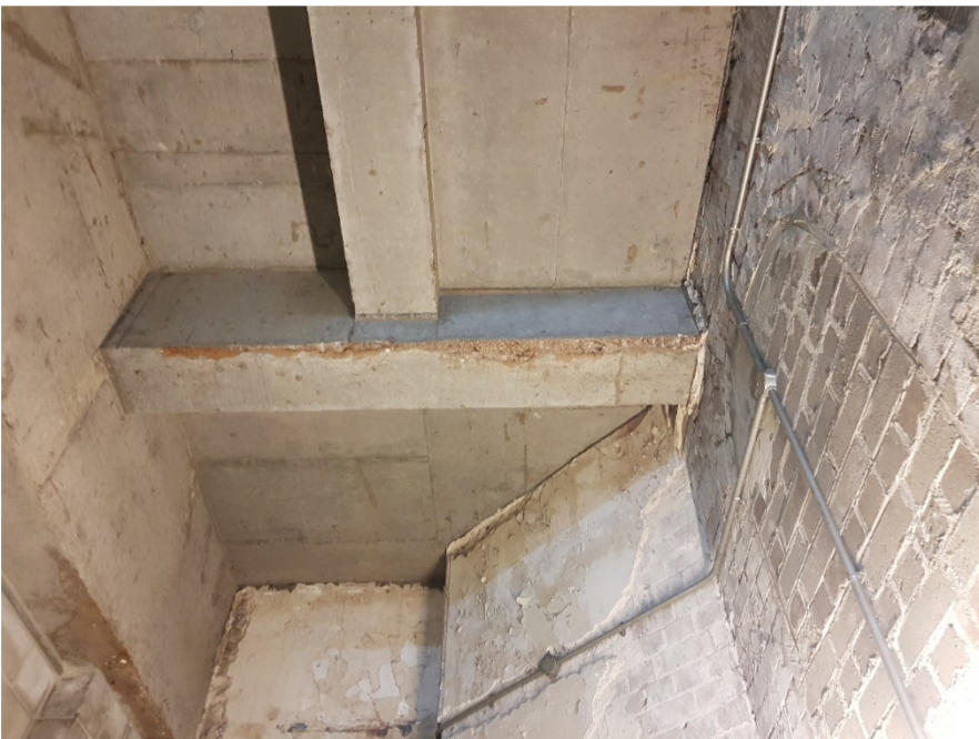
Figure 42: South Fire Escape Damp and Spalling Concrete