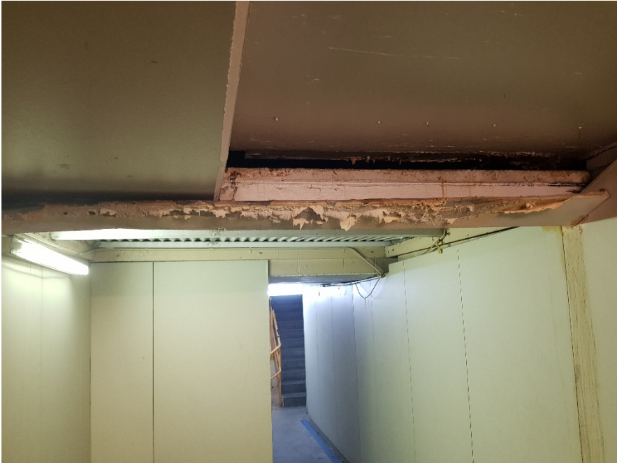
Figure 43: Water Staining Around Lower Ground Gutter in Service Corridor