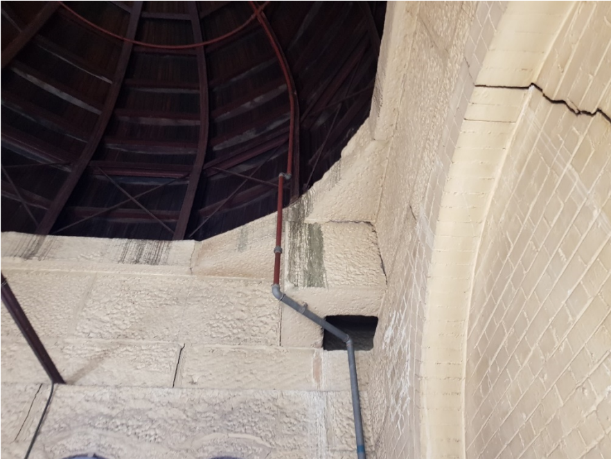
Figure 35: Water Staining From Dome Roof