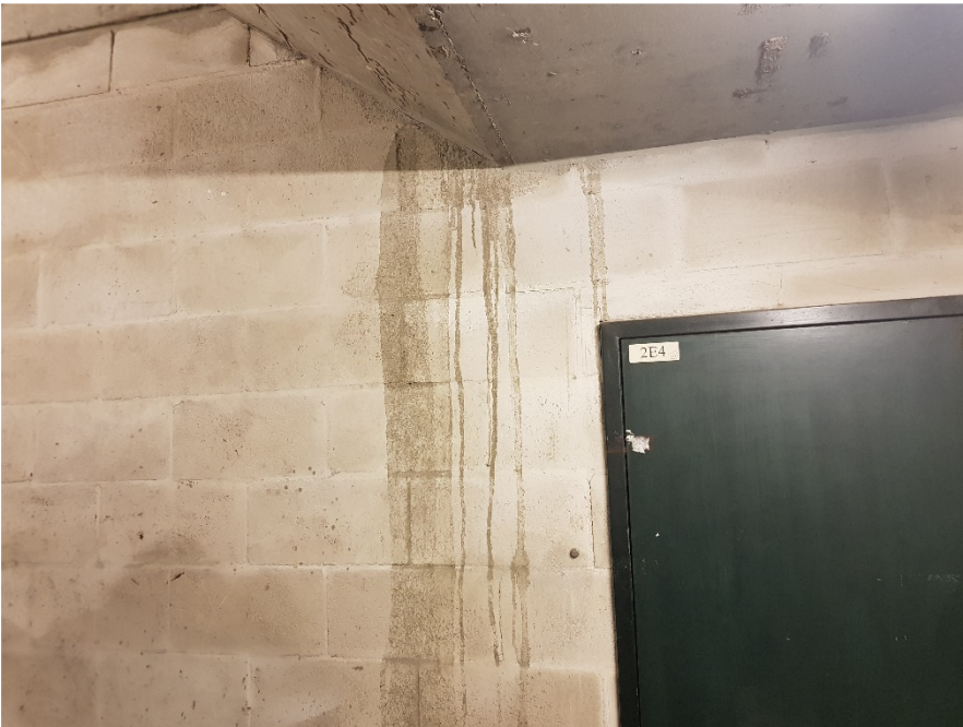
Figure 46: Signs of Water Ingress in Lower Ground Fire Escape