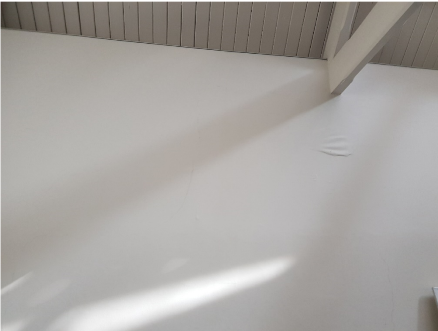
Figure 38: Signs of Water Ingress From The Victoria Room Roof