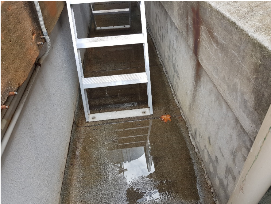
Figure 33: Ponding Water on North East Flat Roof