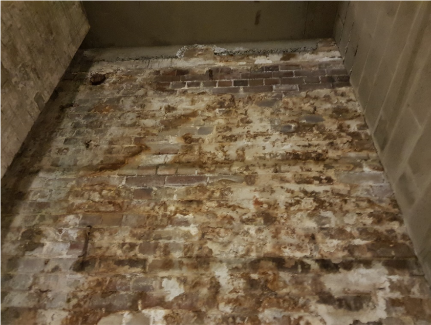
Figure 45: Damp Wall in Lower Ground Fire Escape