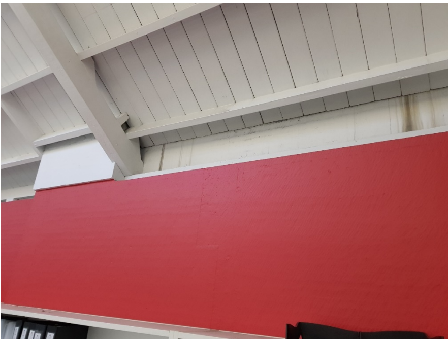
Figure 40: South East Meeting Room Water Staining