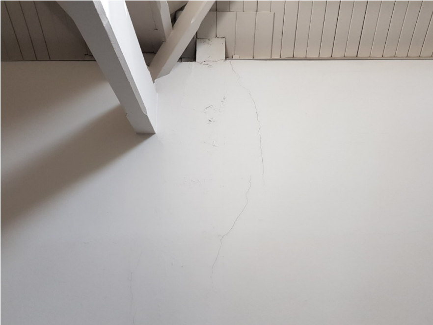
Figure 39: Signs of Water Ingress From The Victoria Room Roof