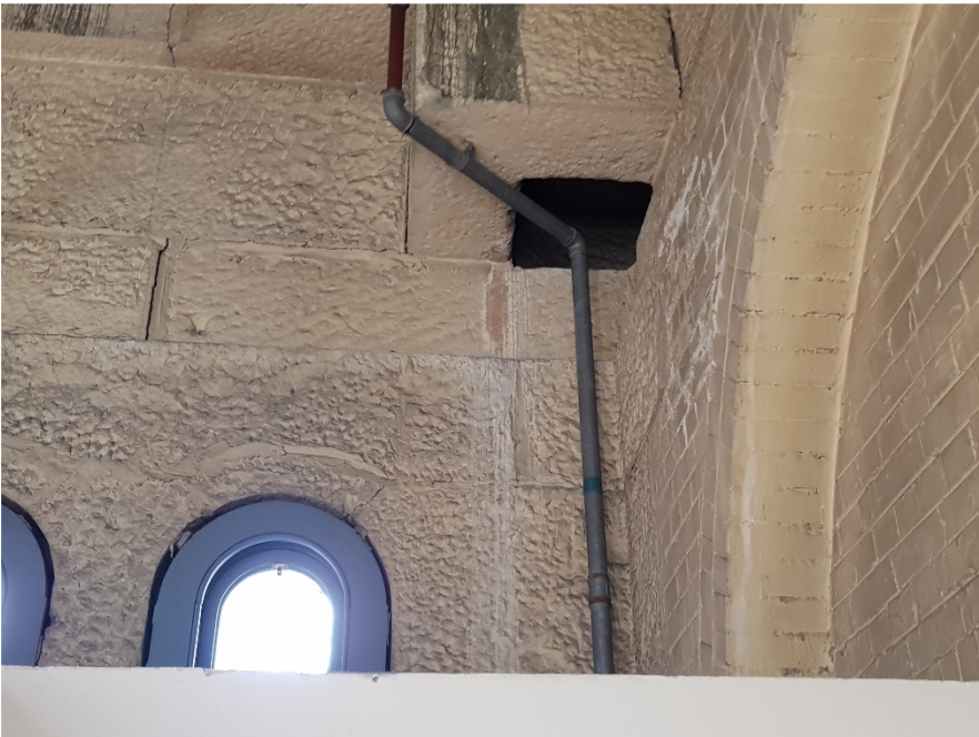
Figure 36: Water Staining From Dome Roof